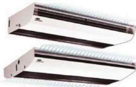
Single and exclusive dual discharge evaporators